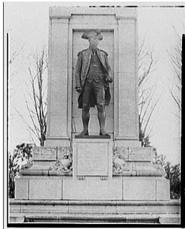
Photograph of the memorial, taken between 1920-1950

In this #TallShipTuesday , we discovered one of Washington DC's hidden gems: the John Paul Jones Memorial. This monument is located on the mall at the intersection of 17 th St. and Independence Ave. where a grand statue of John Paul Jones watches over the cars that drive past.